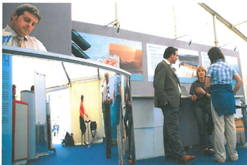
RWE npower renewables' staff talking to members of the public