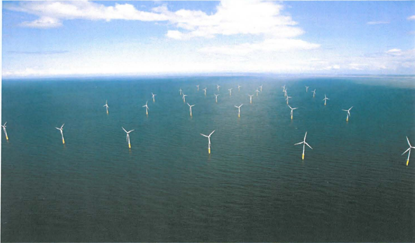
North Hoyle Offshore Wind Farm